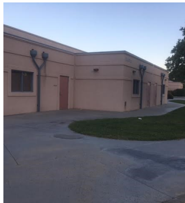
Fence upgrades are underway for Mountainview Elementary

Our goal remains the same: Academic and Personal Success for Every Child.