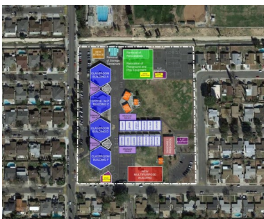
Facilities Planning Sessions with Cedar Creek Elementary