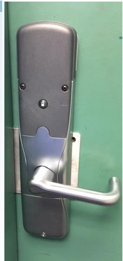
New security lock upgrades